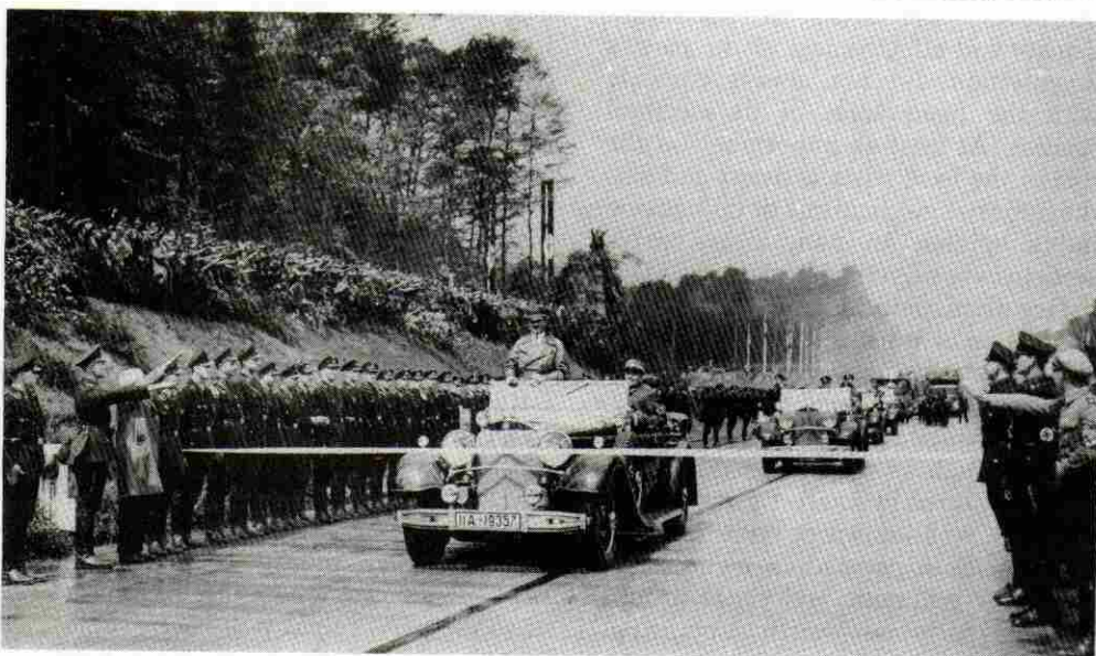
Hitler's appeal to those with a grievance: a programme of public works for the unemployed. (Above left) Workmen salute the Führer after he has laid the foundation stone of the new Reichsbank building in 1934. (Above right) Hitler talking to Nazi youth in 1933. (Left) The triumphal ride down a newly-opened autobahn in 1935.

attracted to Nazism. For many it was partly a question of their future prospects. The job situation for new graduates in the early 1930s was appalling and the Nazi party and its programme of a new order offered – apart from anything else – prospects for future employment for men like the recent graduate in architecture, Albert Speer.