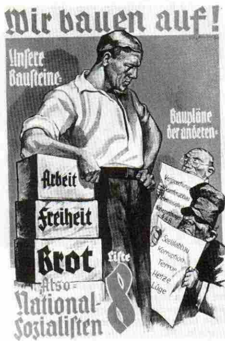
A Nazi poster for the Prussian elections in 1932. The Nazi programme is described as 'reconstruction'. The building blocks are labelled, 'work', 'freedom' and 'bread'.

Hitler from afar, one's local storm troop leader near at hand. These leaders had to prove themselves by their toughness and daring. The nearest equivalent to the psychology of a Nazi storm troop in a city like Berlin is that of the street gang, though the Nazi SA men had an additional sense of self-righteousness when they put the boot in to a Communist – it was their contribution to saving the Nation. The SA also provided concrete material benefits. At a time when social security benefits barely existed, the SA provided food and shelter for those who lacked them in its ad hoc barracks and soup kitchens. Above all, it gave the young unemployed something to do – a focus for their lives, and also the comradeship of others in the same boat as themselves and now working for the same cause. And it was a cause which seemed to offer them some future – these were all powerful incentives to commitment.