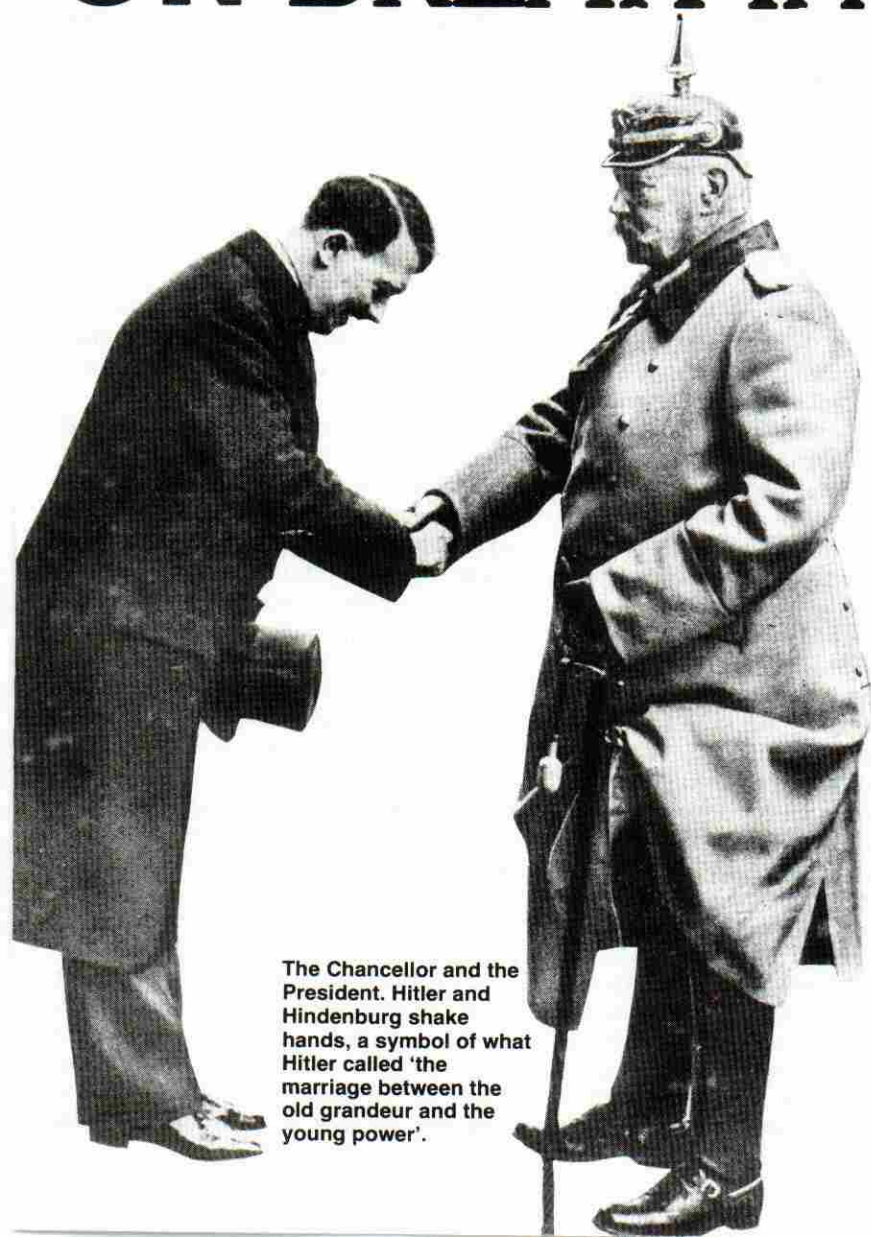
The Chancellor and the President. Hitler and Hindenburg shake hands, a symbol of what Hitler called 'the marriage between the old grandeur and the young power'.