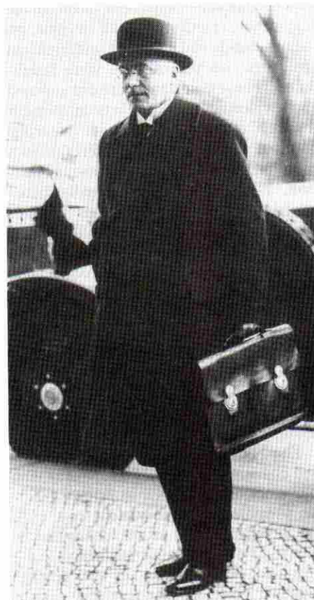
Chancellor Brüning in Berlin, 1932.

Indeed, much appears to have depended on how far the party succeeded in winning acceptance or at least toleration by the local establishment, including the press. Its success rate in integrating itself in some local communities and achieving respectability among the middle class even before 1933 is quite striking.